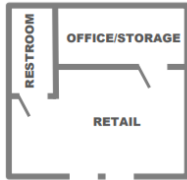
Sample Floor Plan: