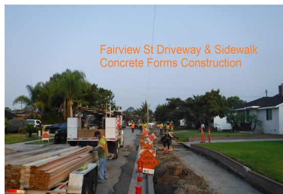
Fairview St Driveway & Sidewalk Concrete Forms Construction