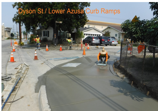
Dyson St / Lower Azusa Curb Ramps