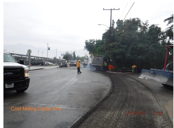
Grinding & Paving Operations Along Cedar Ave