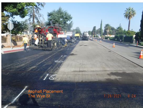
Paving Along The Wye St